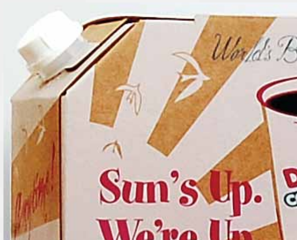
custom print beverage tote