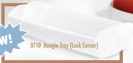
0710 Hoagie Tray (Lock Corner)