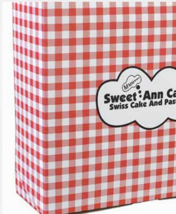
custom print bakery box