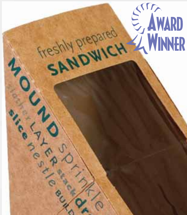
custom print sandwich wedge