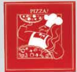
"Gourmet Pizza" Design