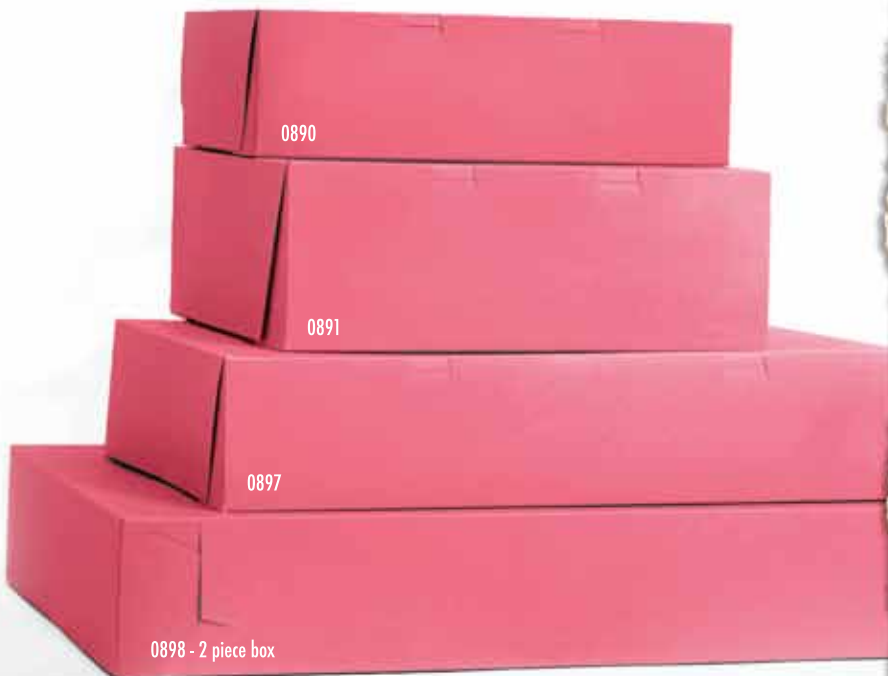
PINK BAKERY BOXES