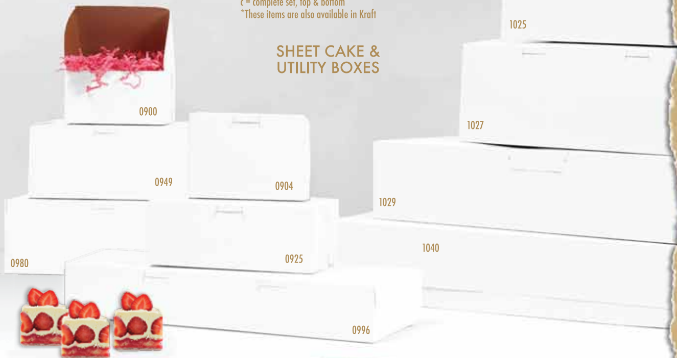
SHEET CAKE & UTILITY BOXES

Non-Window Boxes Cake Boxes Cupcake Boxes Pastry Boxes Pie Boxes Pink Bakery Boxes Sheet Cake Boxes Utility Boxes