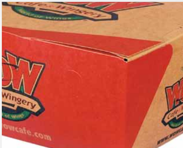
custom print kraft champapak