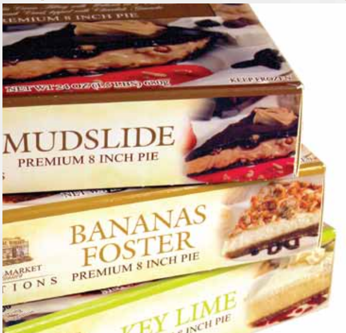
custom box and print - frozen bakery