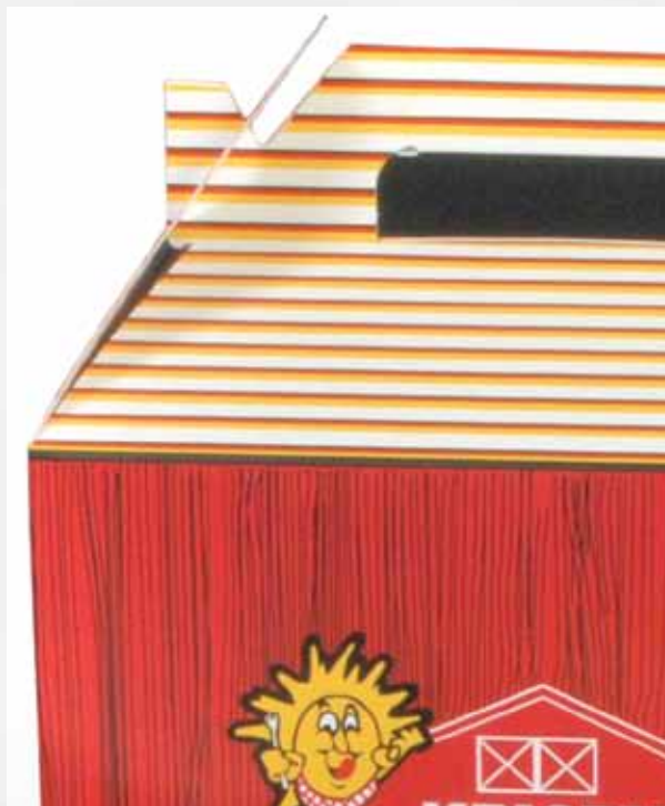
custom print carry out barn