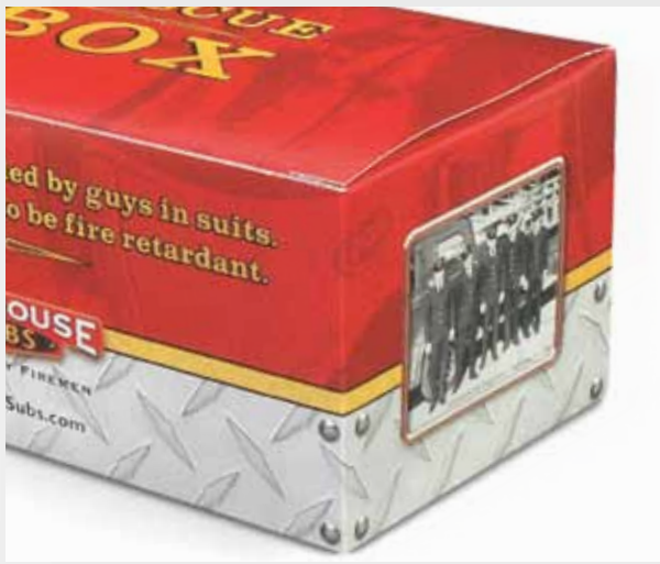
custom print carry out box