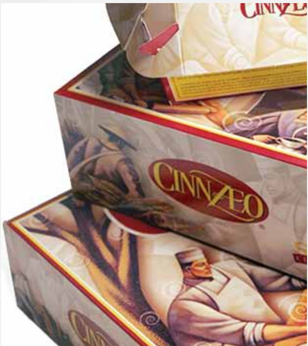
custom box and print - bakery