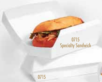
0715 Specialty Sandwich