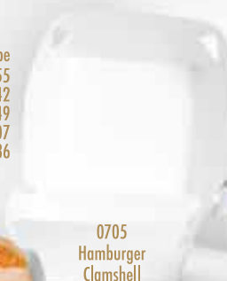
0705 Hamburger Clamshell